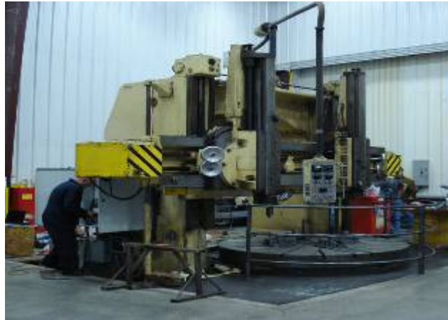
RUSSIAN 1525 Vertical Boring Mill